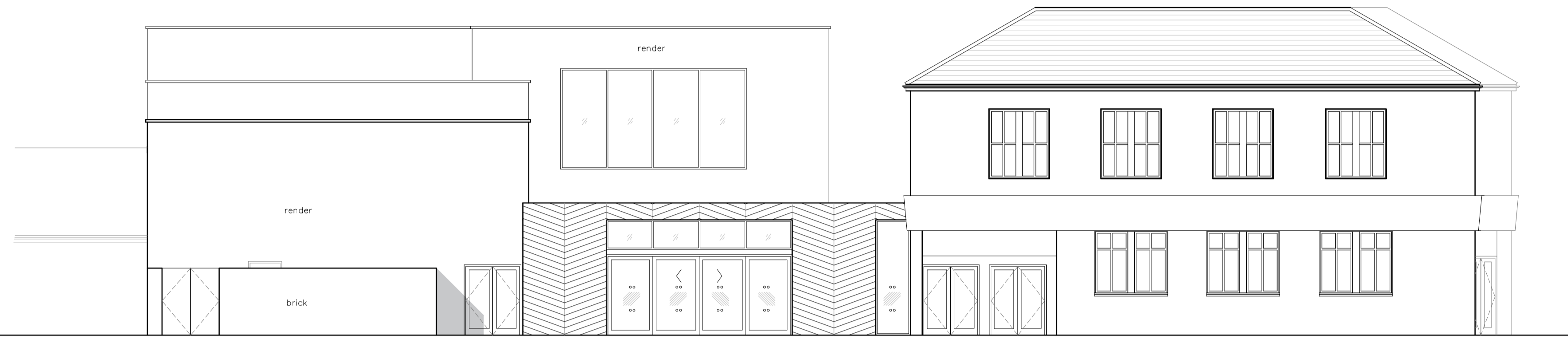
PROPOSED COSTON DRIVE ELEVATION